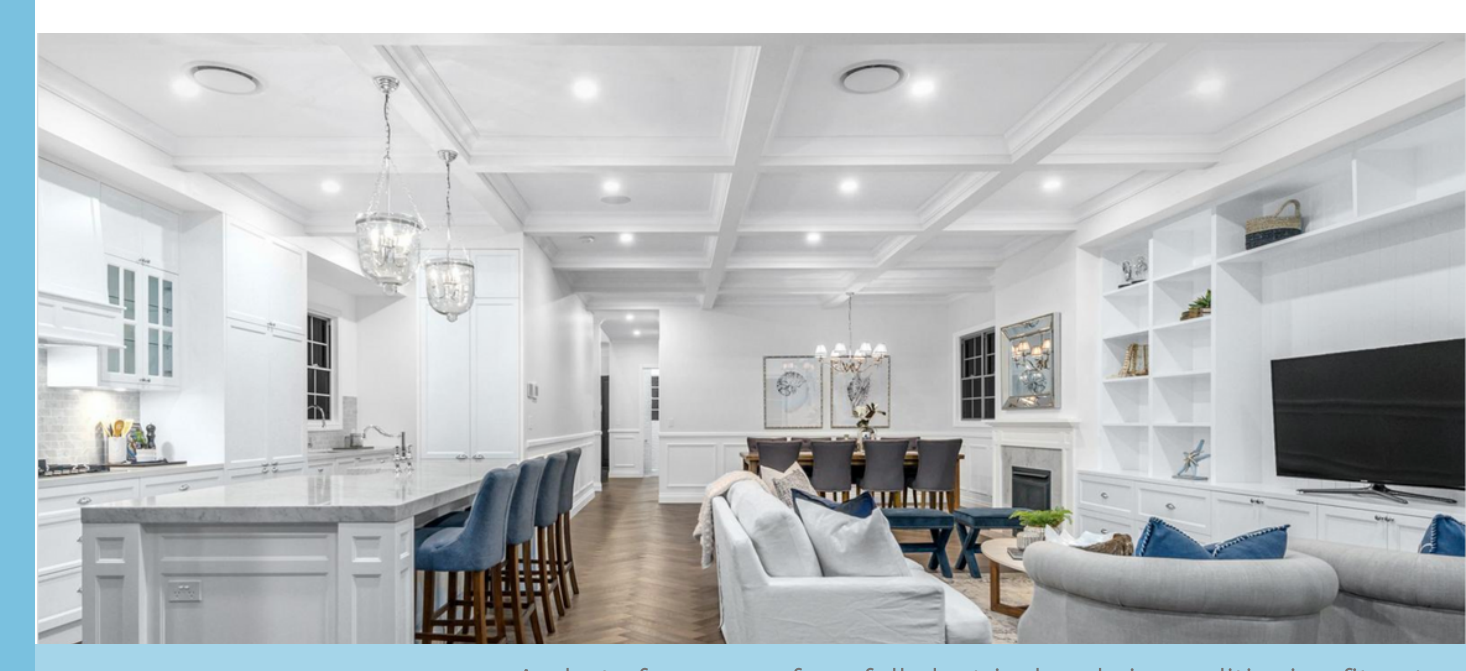
A photo from one of our full electrical and air conditioning fit outs

Prevent illnesses, bacteria, and germs spreading in the air by getting us to service your air conditioners and/or replace your old filters to ensure the air you breathe.